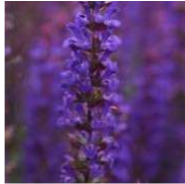
SALVIA SALVATORE BLUE