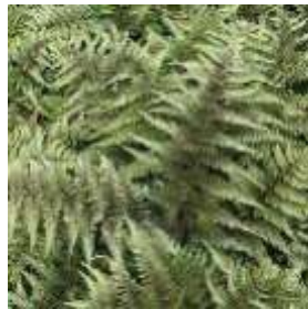
Athyrium nipponicum red beauty