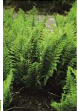
Dryopteris filix-m. Crispa Cristata