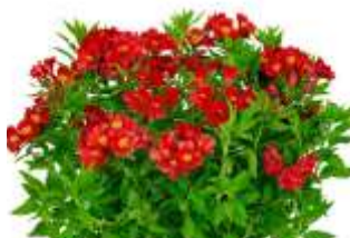
Summer Pepper (Red)