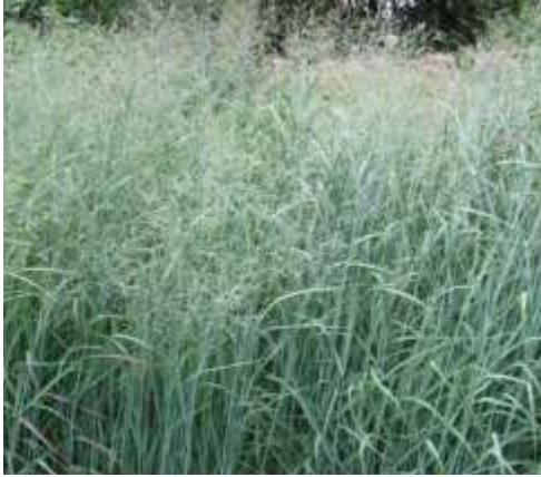
Panicum Prairie Sky

A more compact grass than Miscanthus, upright, with foliage ranging from green to blue, several with nice red/ purple tones through autumn. Later growth than other grasses leads to later flowering and good stature through winter.