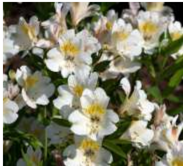
Summer Sky (White)