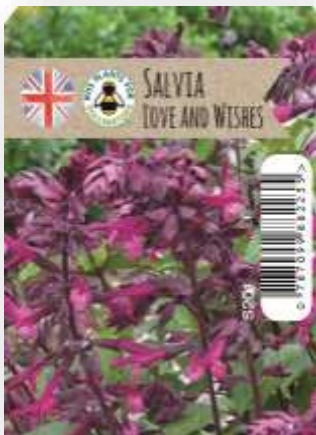
SALVIA LOVE AND WISHES