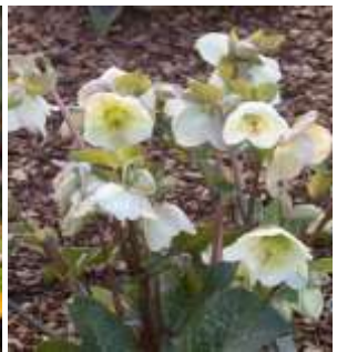
Frost Kiss Molly's White