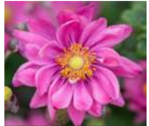
Summer Breeze Rosy Red