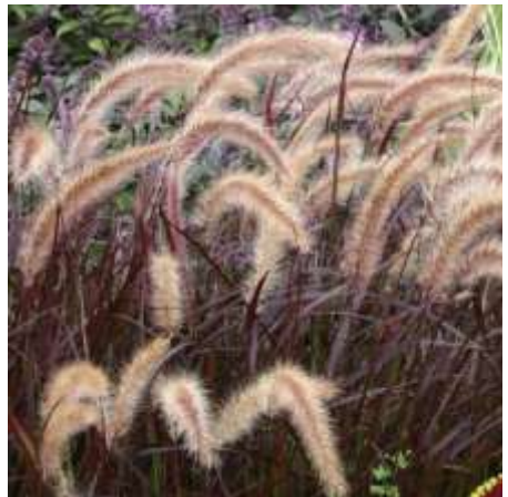
Pennisetum advena Rubrum