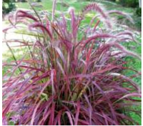
Pennisetum advena Fireworks

Mostly clump forming grasses, Pennisetum all have lovely seed heads that last long into winter after flowering in late summer.