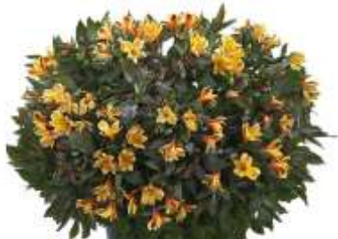
Summer Breeze (Yellow)