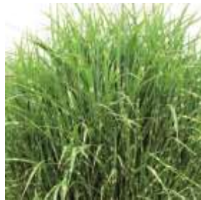
Miscanthus Sinensis Zebrinus