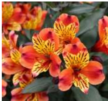
Indian Summer BEST SELLER

The summer paradise series of Alstroemeria is a stunning series, renowned for its hardiness, long flowering season and versatility. A real premium product, customers are always blown away by its performance.