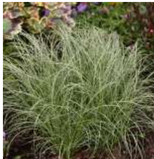
Carex Frosted Curls