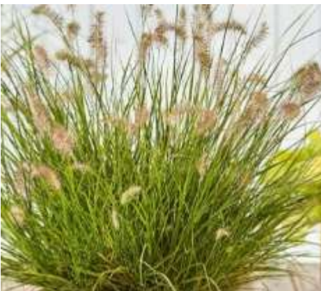
Pennisetum advena Little Bunny