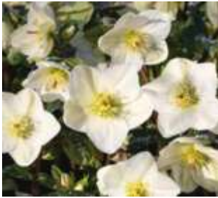
Ice and Roses White

Helleborus are a long term crop for the grower– these plants are on our nursery for around 10 months. We’re gradually building our range of these excellent varieties which are market leading.