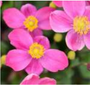
Little Breeze Kiss