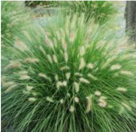
Pennisetum advena Hameln