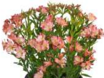
Summer Break (Lilac Pink)