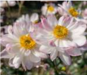
Summer Breeze Pink Touch