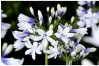
Twister BEST SELLER

We're bulking up our agapanthus stocks and this year we will be offering large chunky plants that have grown on our nursery for almost a year.