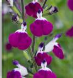
SALVIA AMETHYST LIPS