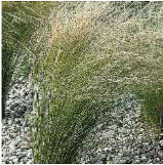
Stipa tenuissima Pony Tails