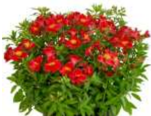
Summer Heat (Red)