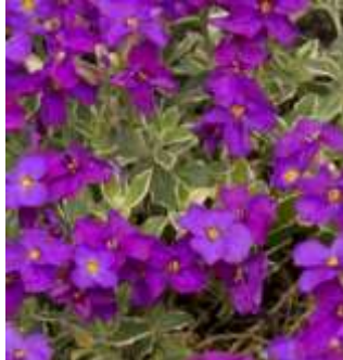
Dr Mules Variegated