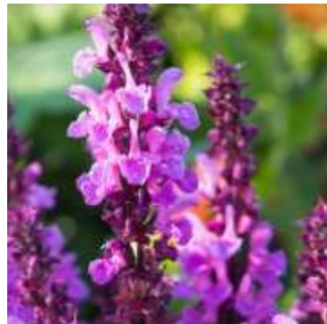
SALVIA ROSE MARVEL