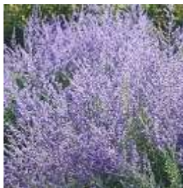
Perovskia 'Blue Spires'