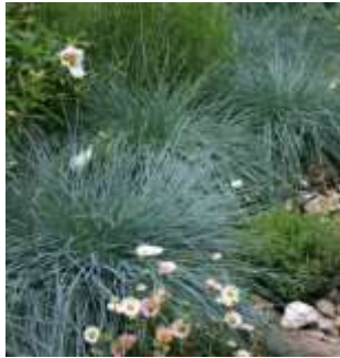
Festuca Glauca Elijah Blue