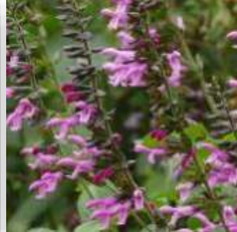
SALVIA PINK AMISTAD