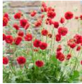
FIRE STARTER— NEW