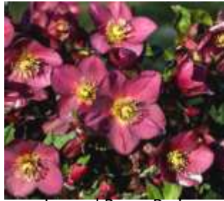
Ice and Roses Red