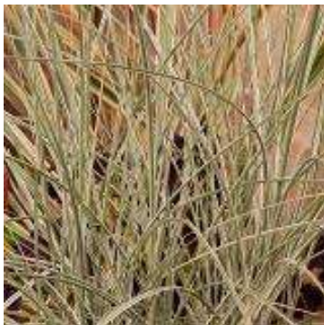
Miscanthus Morning Light