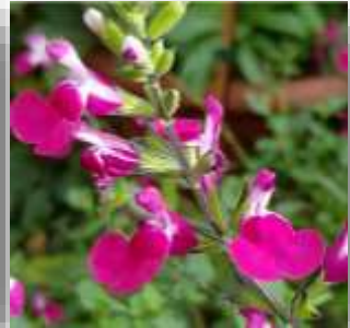
SALVIA CHERRY LIPS