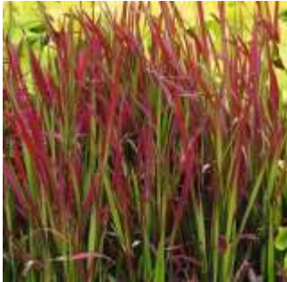
Imperata Cylindrica Red Baron