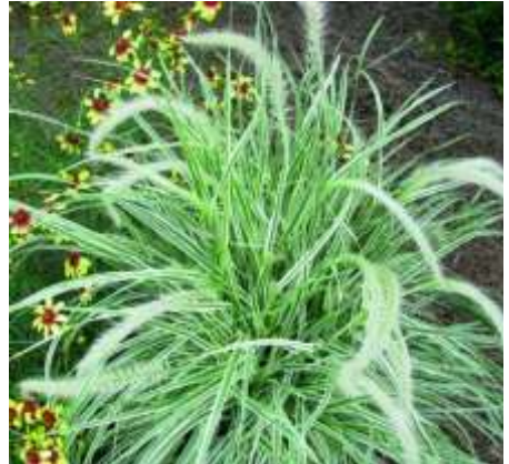
Pennisetum Sky Rocket