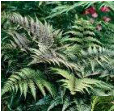
Athyrium nipponicum metallicum