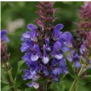
SALVIA BLUE MARVEL