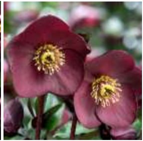
Ice and Roses Brunello