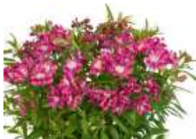
Alstroemeria Summer Chic (New)