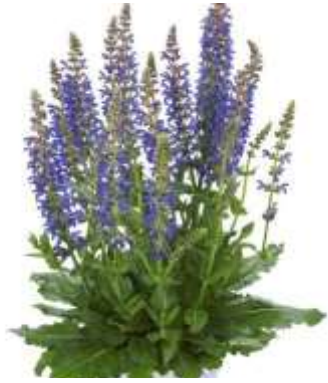
SALVIA APRIL NIGHT