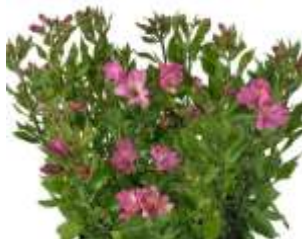
Summer Saint (Pink)