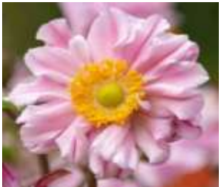
Summer Breeze Whirlwind Pink