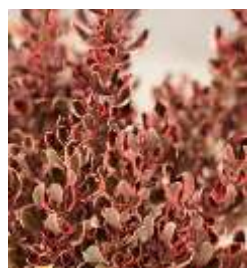
Coprosma Pacific Dawn

Our shrub ranges will be initially be grown in a 3L pot in June/ July, faster lines will be available in the autumn, while other lines will be grown on for the following year sales. This may be in a 3L Pot, 5L Pot or 10L pot depending on the plant. In addition to these ranges we have over 30 other shrubs in trial for 2026. We expect many of these to be listed in our catalogue once trials have taken place.