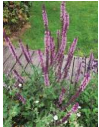
SALVIA CARADONNA PINK