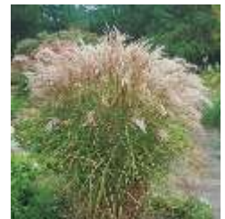
Miscanthus Kleine Silberspinne