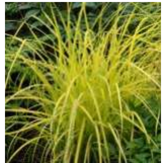
Carex Bowles Golden