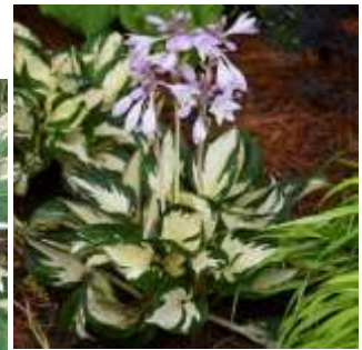
FIRE AND ICE