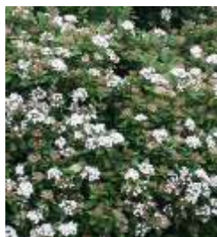
Viburnum 'Eve Price'